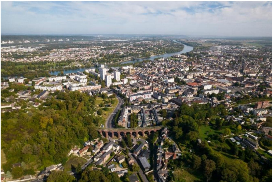
Elbeuf from above