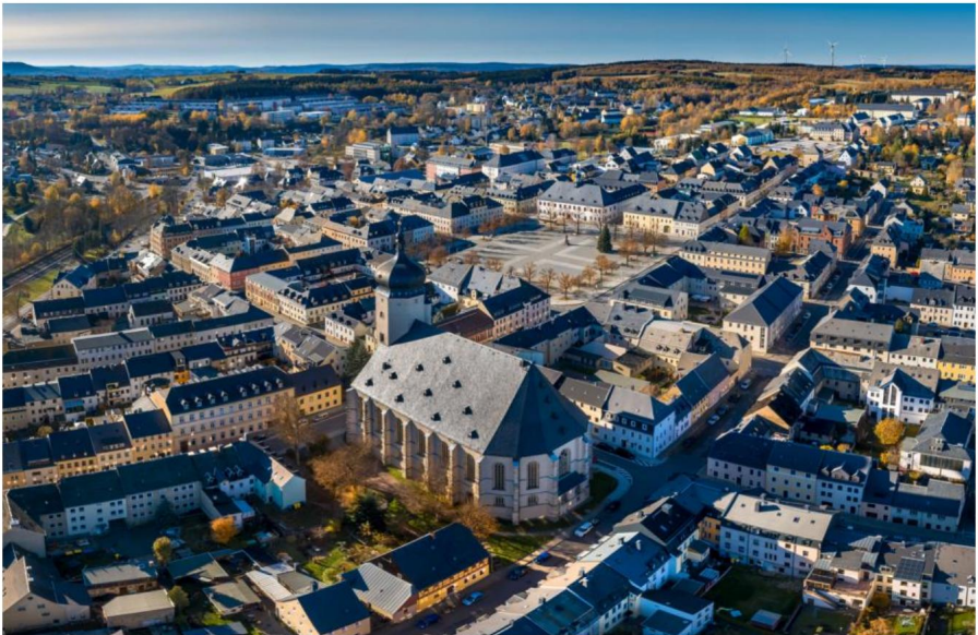
Marienberg from above

Mayor of the large district town of Marienberg