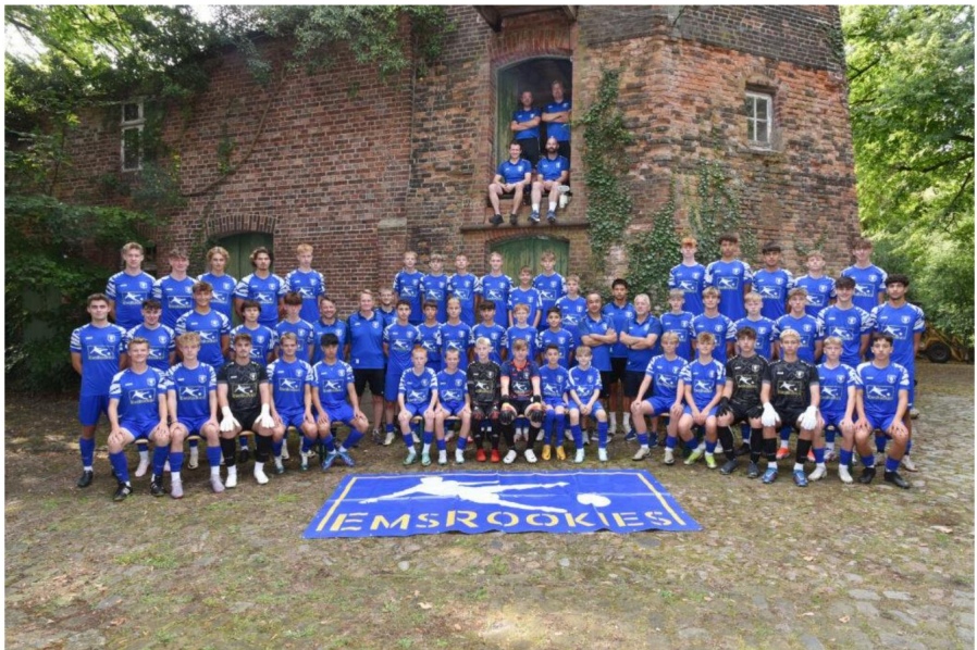
The three EmsRookies teams in the 2024/2025 season

Today, they are proof that it's possible to combine competitive football with a sense of home. With an eye toward the future, and with a sense of responsibility for what makes our city special.