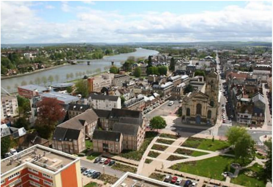
Square Saint-Jean with the Catholic Church Eglise St. Jean