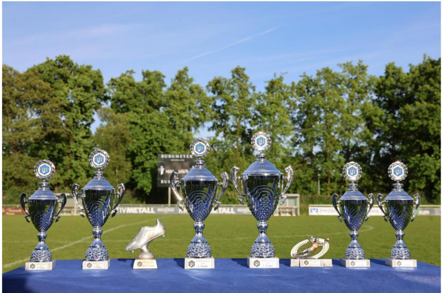
Awards and trophies of the Friendscup 2025